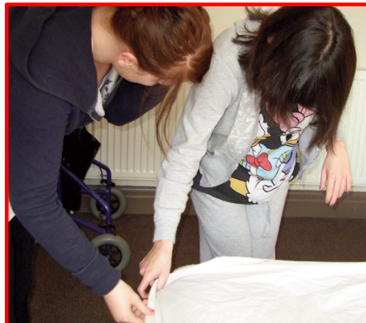
A lot of things a lot of the time