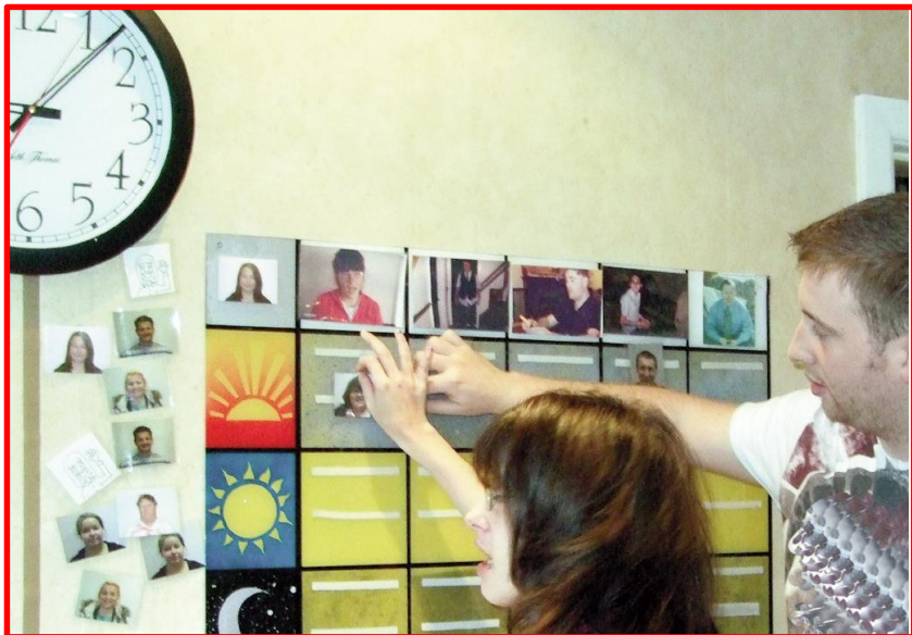
Choosing and planning what to do