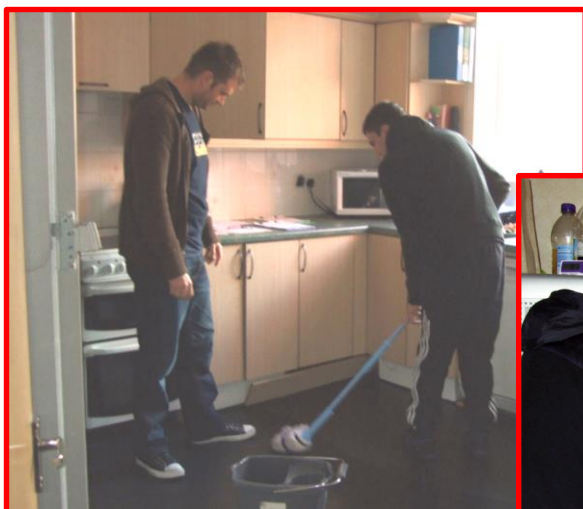
Some tasks some of the time